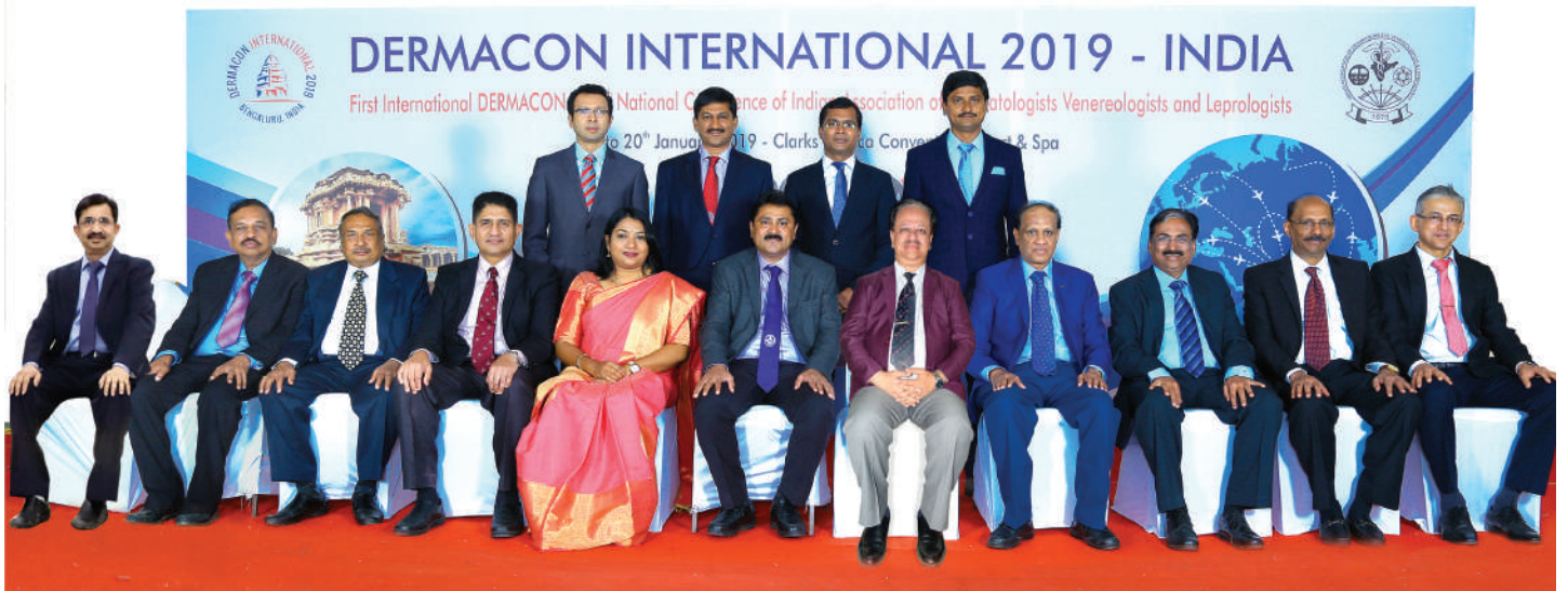
Organising Core Committee